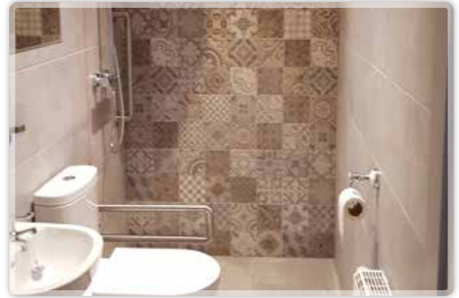
Porcelanosa Ensuite & Wet Rooms