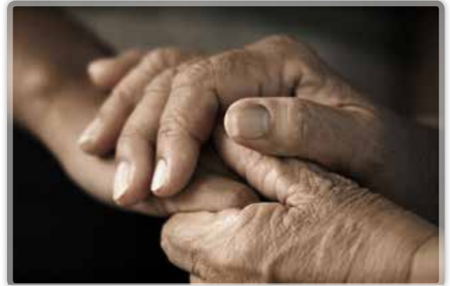
Hear to hold your hand all the way