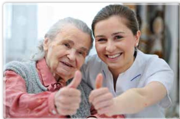
Happy Staff and Happy Residents